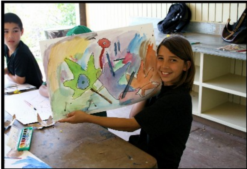
Armory Center for the Arts, Children Investigate the Environment