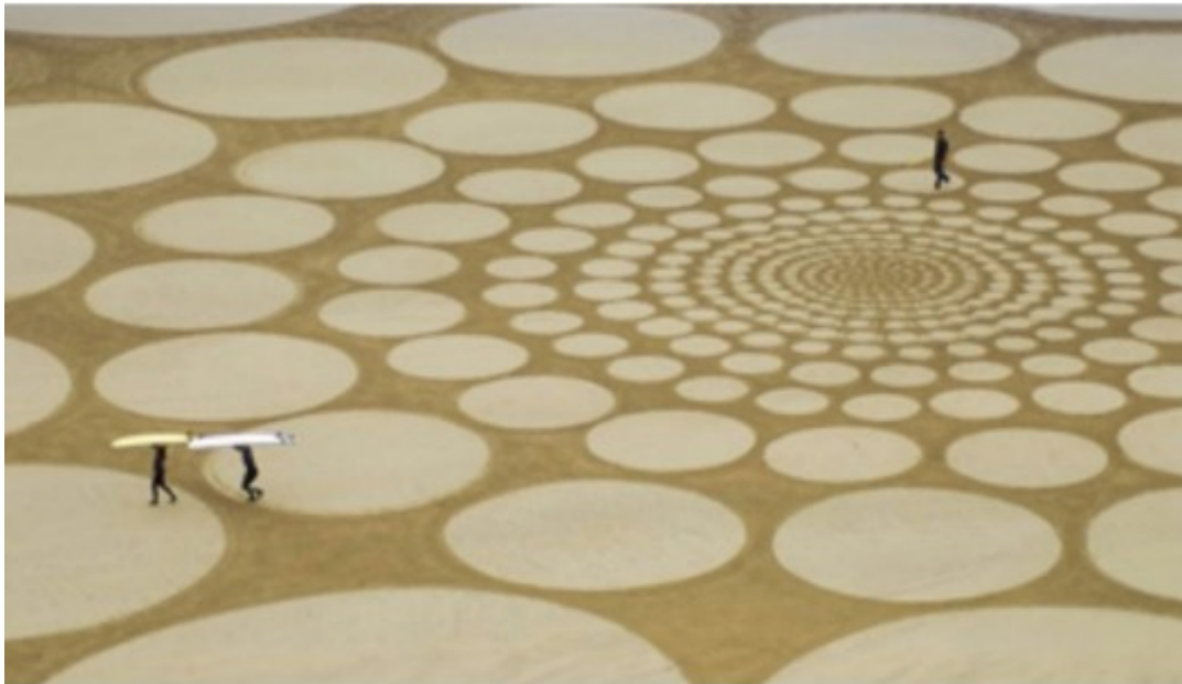
Jim Denevan, Surfers in Circles