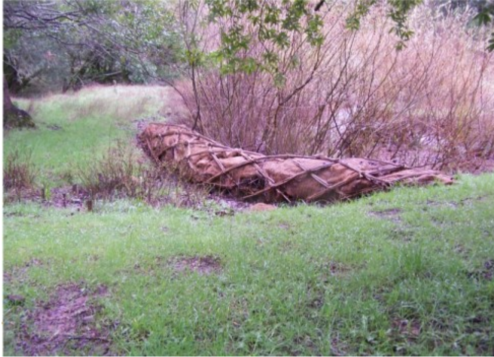
Daniel McCormick, Watershed Sculpture Installation

materials harvested from willow trees. Deets is also involved in the 2007-2011 Green Streets movement, a plan to use storm water runoff to green over 8000 square miles of streets in LA.