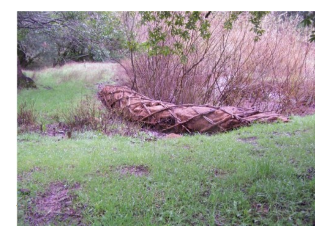
Daniel McCormick, Watershed Sculpture Installation

materials harvested from willow trees. Deets is also involved in the 2007-2011 Green Streets movement, a plan to use storm water runoff to green over 8000 square miles of streets in LA.